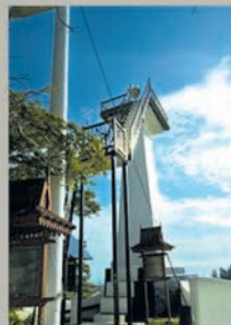
The driveway towards Kota Gelanggi

The Princess Hill is among the local's favourite spots for a gentle walk with a breathtaking view. Opens to the public daily from 9am to 5pm.