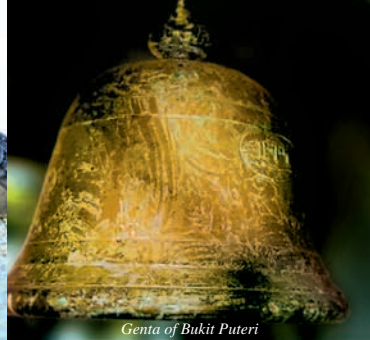
Genta of Bukit Puteri