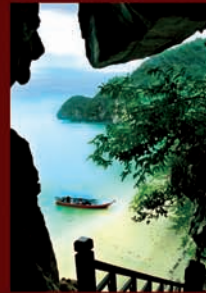
View from mouth of Gua Cerita

Located in the northern part of the main island of Langkawi, Gua Cerita is easily accessible by boat from Tanjung Rhu. Cave explorers can expect to find fascinating stalactites and stalagmites as well as faintly legible ancient inscriptions on the walls.