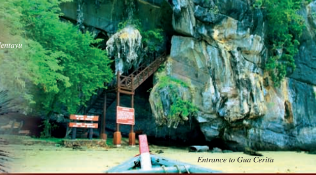
Entrance to Gua Cerita

Gua Cerita or Cave of Stories is a cavern alive with captivating legends. The most famous is the one concerning the origin of Kedah's royal lineage as related in the Epic of Merong Maha Wangsa or Hikayat Merong Maha Wangsa .