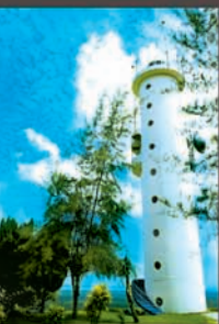
Jugra Lighthouse compound

Jugra Hill or Bukit Jugra offers a panoramic view of a horizon that overlooks mountainous divides and stretches beyond the Straits of Malacca. This hill with its spectacular landscape is also the home to the great Sri Jugra Lighthouse.