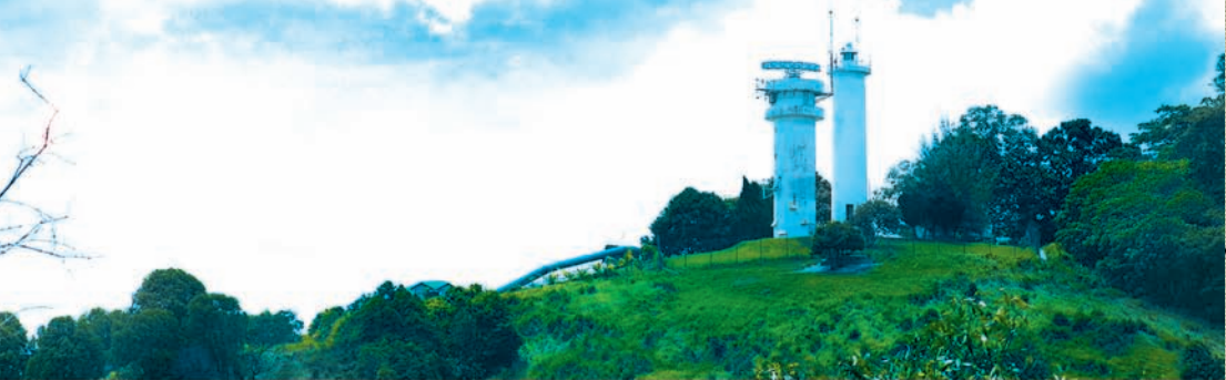
Panoramic view of Jugra Hill